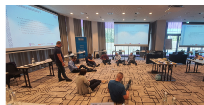
Trainings - PO WER project