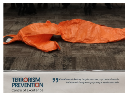
Trainings - PO WER project