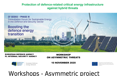
Workshops - Asymmetric project

The aim of the project is to prepare public administration to a more effective detection and countering of terrorist and asymmetric threats, on the basis of cross-national experiences. The aim of the project will be reached based on Polish (mainly ABW) and international (mainly the Croatian SOA) experience, as well as the input from international experts. Reaching the aim of the project will result in strengthening the synergy of activities conducted by individual public administration institutions.