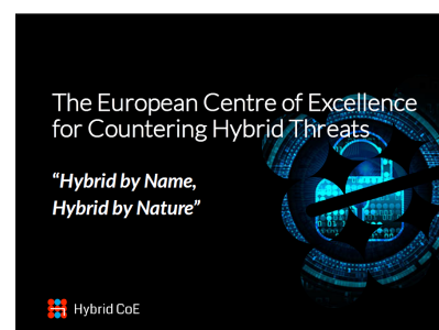
Workshops - Asymmetric project