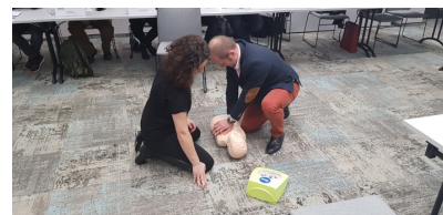
Trainings - PO WER project