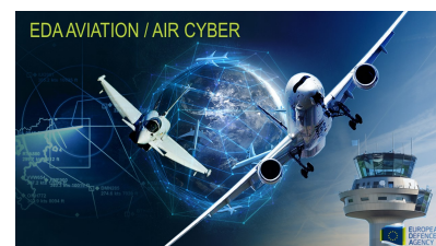
Workshops - Asymmetric project