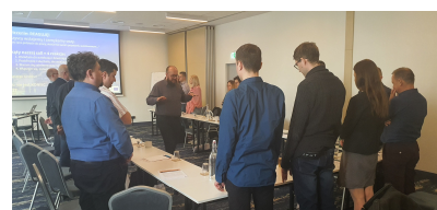
Trainings - PO WER project