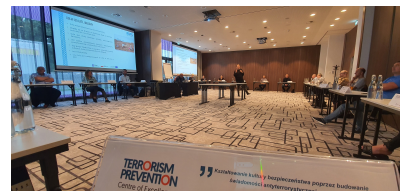
Trainings - PO WER project

The project "Increasing the competences of state security services, public administration employees and scientific and research centers and the development of